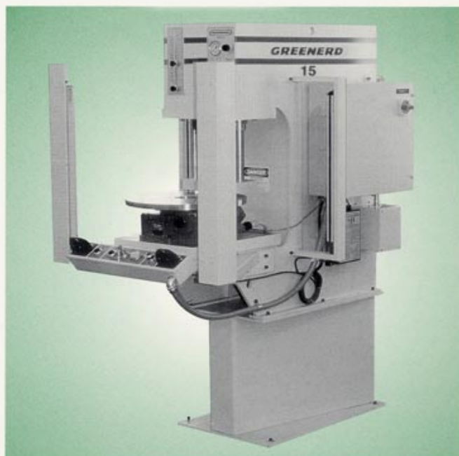
15-Ton C-Frame Bench Press with rotary table and operator safety guards

Greenerd hydraulic trim presses are protected from the damaging effects of airborne particles. Extra filtering of hydraulic oil, flexible covers over moving parts, heavy-duty seals around rotating parts, totally enclosed fan-cooled (TEFC) motors, and other protective features ensure long life and years of trouble-free service in even the most hostile foundry environments.