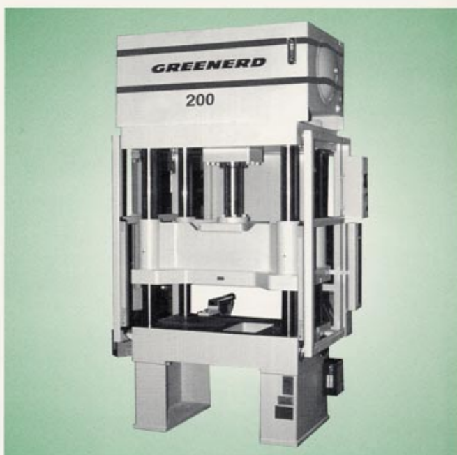
200-Ton 4-Post Press with heavy ram guiding and operator safety guards

For additional information, applications assistance, or a quote, call today: