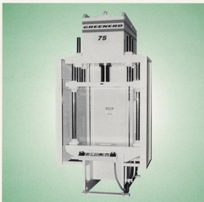
75-Ton C-Frame Press with superior ram guiding and operator safety guards